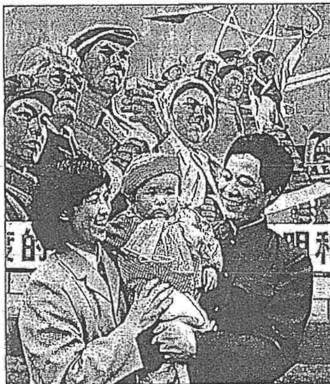
Family at Beijing Zoo.

Overview: In 1980, leaders in China feared that their nation did not have enough resources to support its huge and rapidly increasing population. To avoid what might become an overpopulation disaster, these officials implemented a far-reaching population control program called the one-child policy. The program has been revised since 1980, but after more than 30 years, it remains in place. This Mini-Q asks whether or not the one-child policy has been a good idea for China.