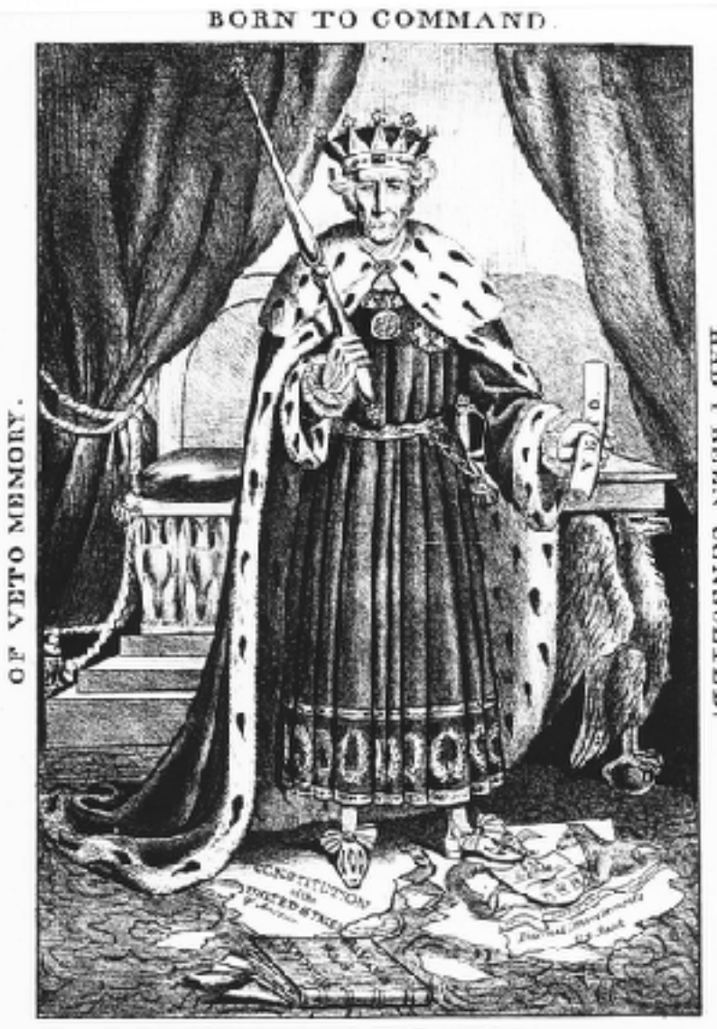
KING ANDREW THE FIRST.

Political cartoons are often used by artists to express a political opinion to a broad audience. A picture can convey many different ideas to the onlooker. During Andrew Jackson's presidency there were many political cartoons about the controversial president (some favorable and some unfavorable). Below are some examples: