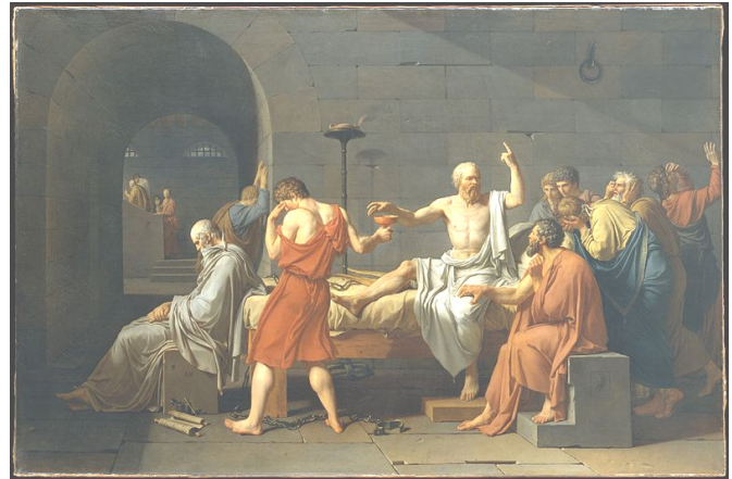
The Death of Socrates , by the painter Jacques-Louis David (1787). Some scholars believe that Socrates may have been an invention of the philosopher Plato since the only record of Socrates seems to come from Plato's writings.

The highly poisonous Hemlock plant...a relative of the carrot. It's Latin name is Conium maculatum . "Conium" comes from the Greek konas (meaning to whirl), a reference to vertigo, one of the symptoms of eating the plant.